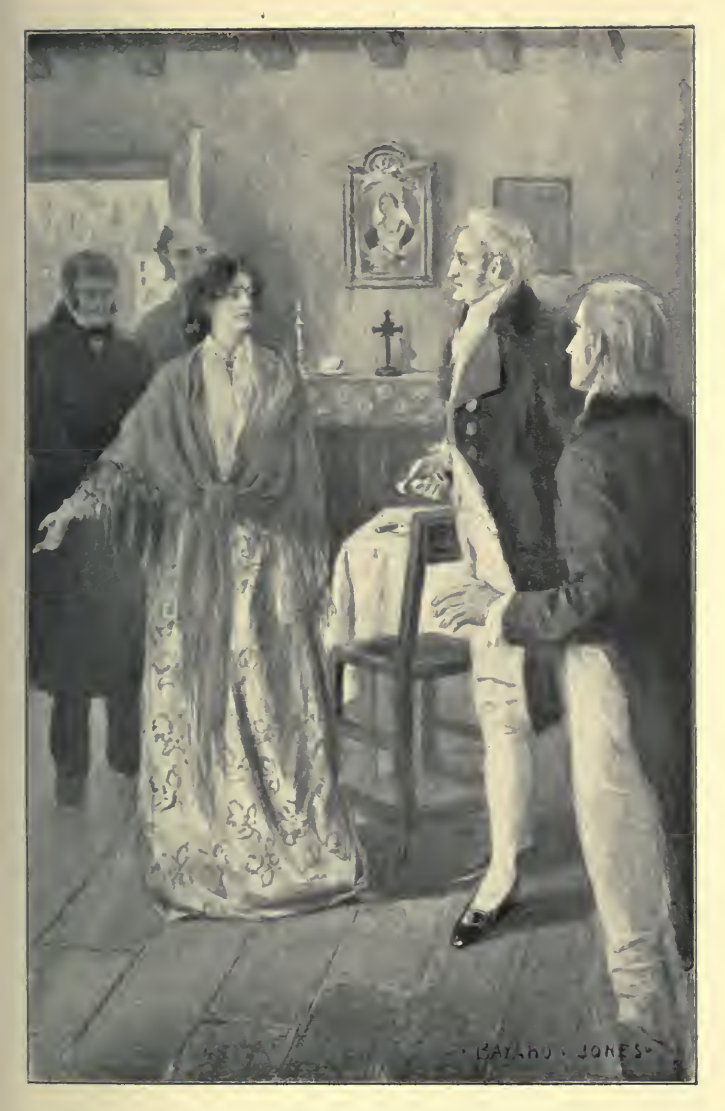
"The proof, Monsieur, is the word of this man, who of his own free will comes to return to you—to give you a fortune."